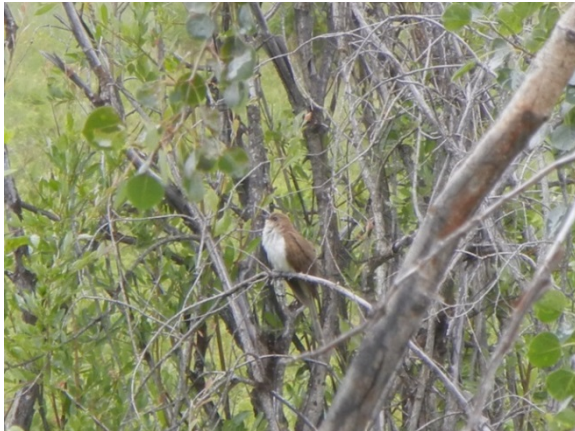
Figures 2 & 3: Record #26: Black-billed Cuckoo adult along Beaver Lake Road, Winfield on July 6, 2014.