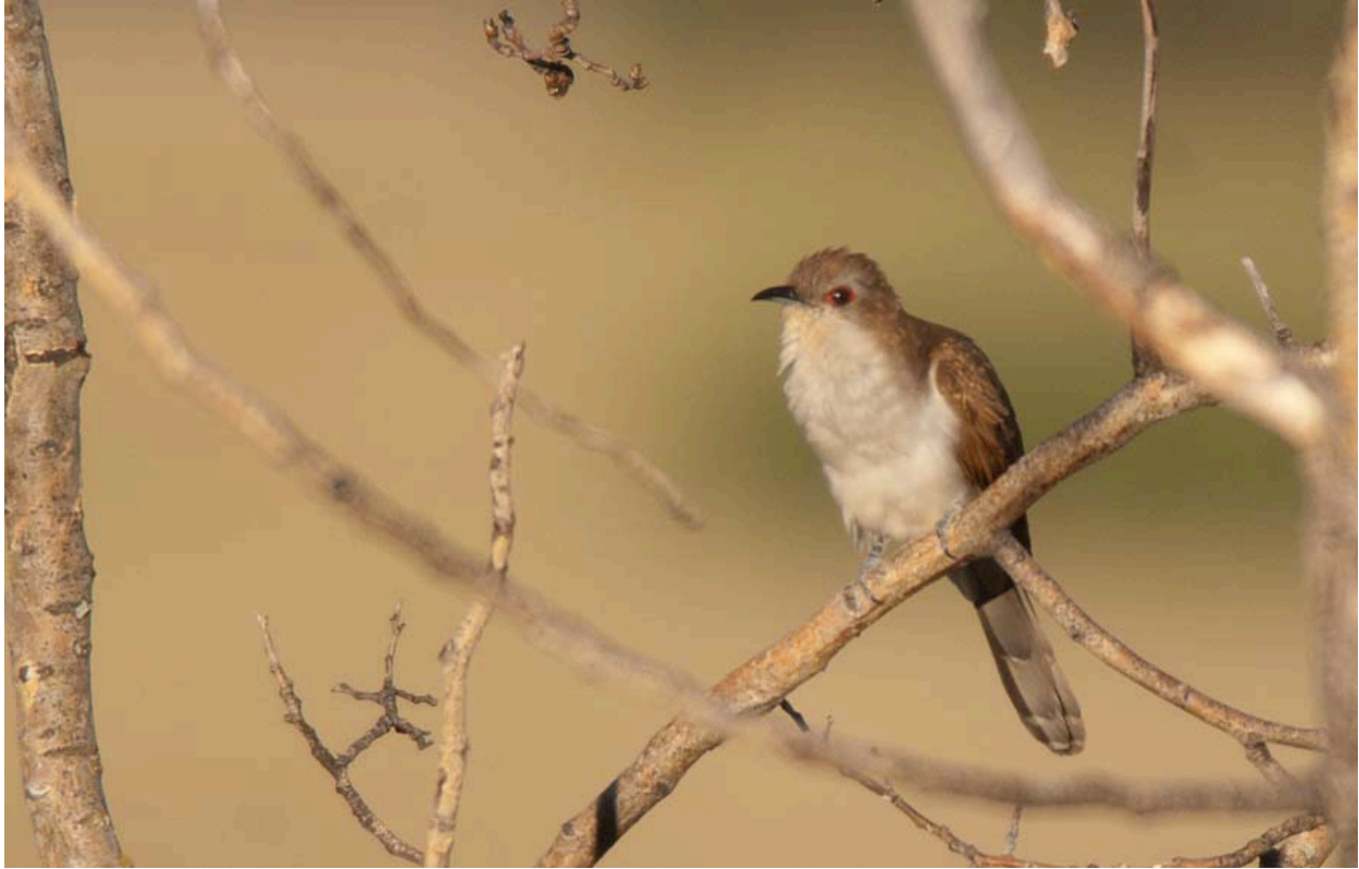
Figure 1: Record #26: Black-billed Cuckoo adult along Beaver Lake Road, Winfield on July 6, 2014.