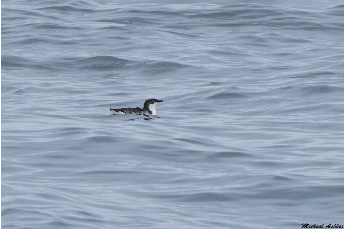
Figure 1: Scripps's Murrelet adult found off Westport Washington on September 7, 2014.